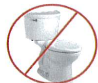
NOT a Trashcan