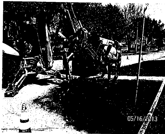
City employees Jason Olberding, James Bruns and Steve Morlan prepare a corner garden.

steel cans and plastic containers. Do not put these containers in separate plastic bags. Follow the guidelines and we can stop recyclables from blowing around town.